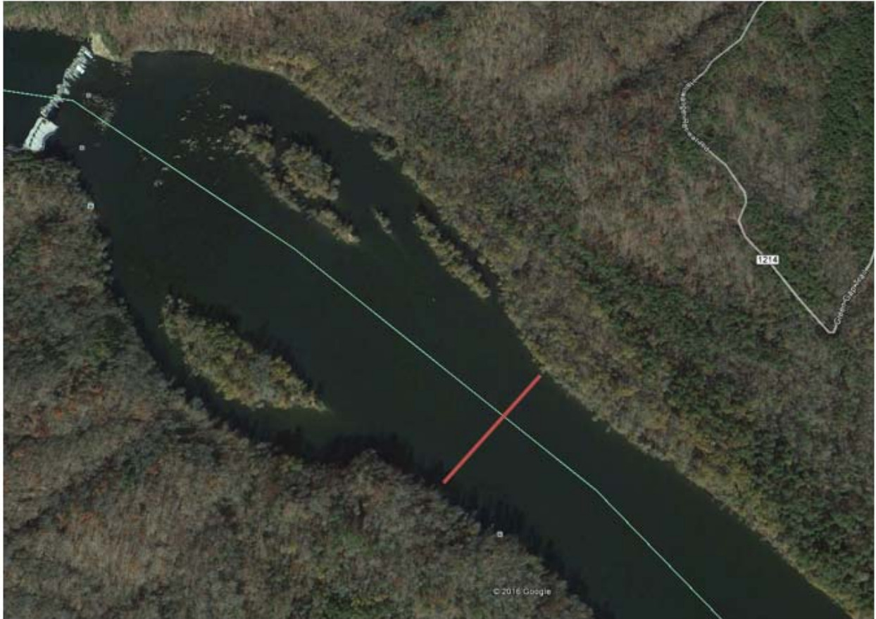
Figure 3 Approximate Location of Falls Flow Monitoring Device Transect

15-minute increment flow data will be stored in a database maintained by Cube and will be available on the Project website at http://cubecarolinas.com/ .