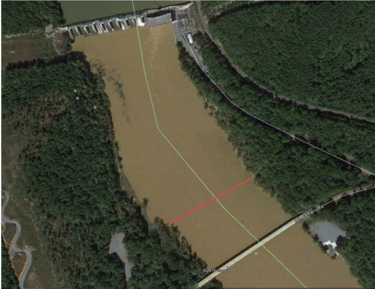
Figure 2 Approximate Location of High Rock Flow Monitoring Device Transect